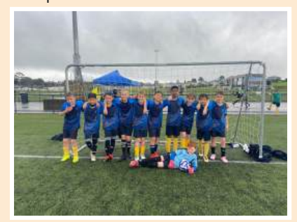
Ellerslie School Girls and Boys Competitive Football Teams